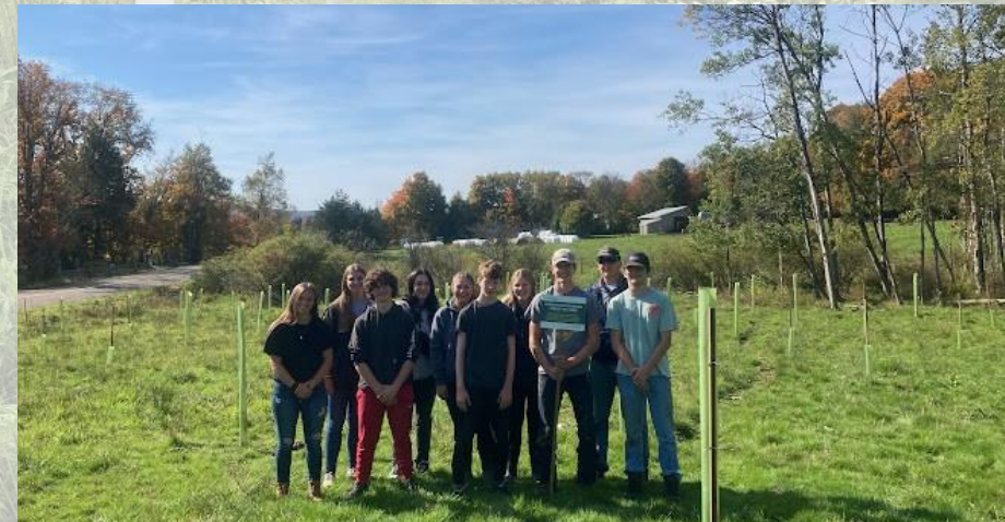
Local school groups participated in plantings on agricultural land within the county. 200 trees & shrubs were planted with 10 volunteers.