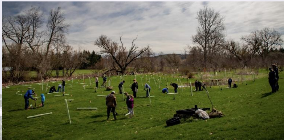
Hickories Park Arbor Day Community Tree Planting took place in April of 2022. We had over 20 volunteers join us, and 340 trees & shrubs were planted.

An integral part of what makes Tioga County's riparian buffers possible is the support of our volunteers. The District is always looking for ways to create new partnerships and forge new friendships with those in the community who wish to make a meaningful difference in the watershed. This year, 150 volunteers worked with the District to help plant riparian buffers all across the county.